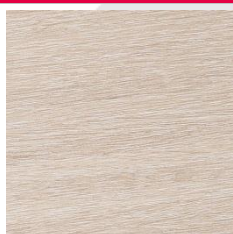
Honey Matt 140