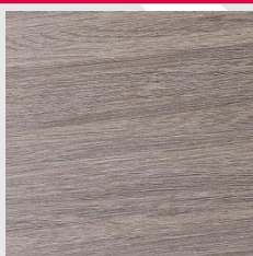
County Matt 139